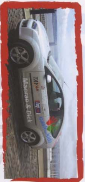
Radio Tay's Cash for Kids car sponsored by Macrae & Dick

And, unlike many charities with high administration costs, we hope that in the coming months will be able to pay back out every pound in full that you donate, directly to helping our Tay territory youngsters.