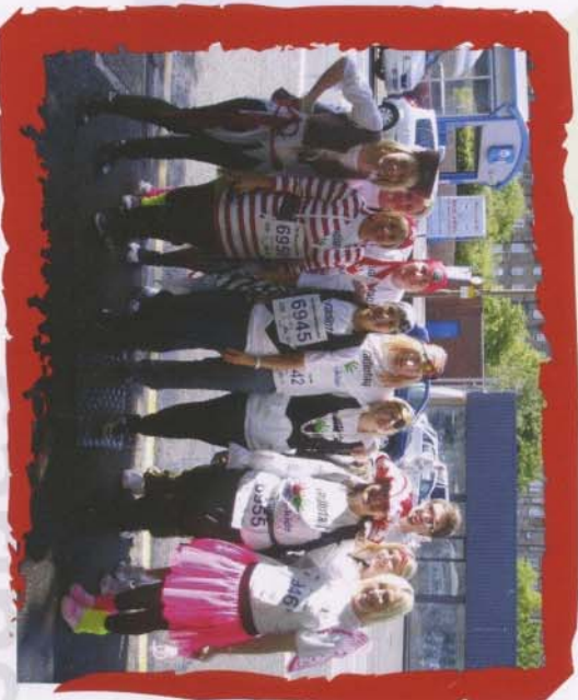
Radio Tay team adopt a pirate theme for this years Great Scottish Walk.

Corporate sponsors, schools, sports groups, office staff, services and individuals use their imagination to help Cash for Kids turn dreams into reality. You decide you want to help and the CFK team will be there to support your effort.