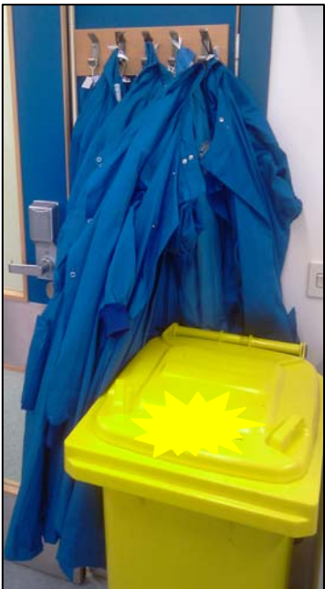
figure 2: CL2 TC Suite