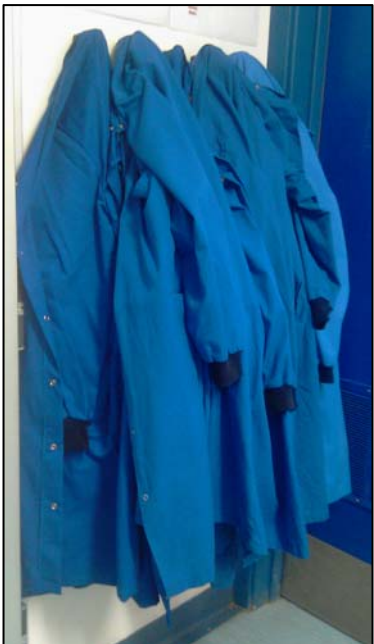
figure 3: CL2 TC Suite