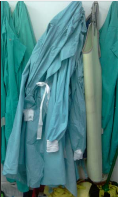
figure 1: Hot Room

Lab Managers have indicated that there are not enough coat hooks for storing lab coats in TC Suites and Hot Rooms. See figures 1 to 3 for examples. This leads to lab coats being piled up on top of each other and, in turn, concerns about contamination being transferred from one coat to another. In many areas there is simply not enough space for additional coat hooks. We cannot insist that lab coats are worn if we do not provide adequate storage facilities. Therefore, an alternative storage solution must be found. One option is to store the lab coats in racks to similar to those shown in figure 4. Any comments? Can we go ahead with a trial?